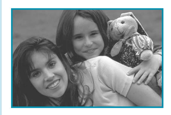
What it's all about.